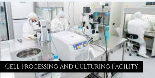
CELL PROCESSING AND CULTURING FACILITY