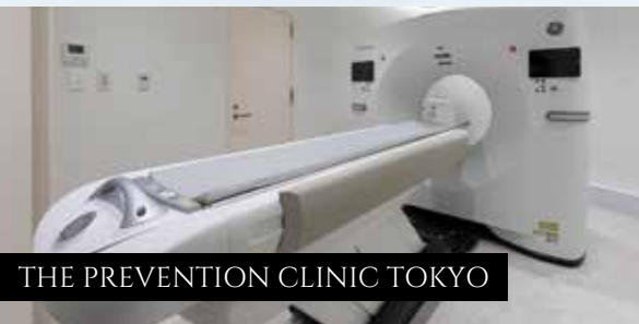
THE PREVENTION CLINIC TOKYO