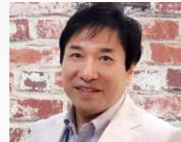
Chief Advisor for MRI Image Analysis

Specialist in drug discovery science, molecular biology, and immunology. Graduated from the Faculty of Pharmaceutical Sciences at the University of Tokyo and earned a Ph.D. in Pharmaceutical Sciences from the University of Tokyo Graduate School. He has held research positions at Albert Einstein College of Medicine, Memorial Sloan Kettering Cancer Center (New York, USA), and RIKEN (Japan). Since 1999, he has been a Professor in the Department of Biotechnology, Faculty of Engineering, Tokyo University of Science. Since his tumor virus research at Memorial Sloan Kettering, he has consistently focused on identifying therapeutic target molecules, developing antibody production methods, and advancing antibody-based drug development. He has produced over 700 research antibodies and holds world-leading achievements in diagnostic and therapeutic antibody development.