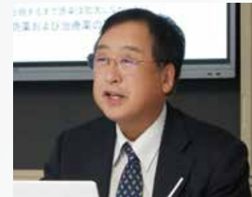
Advisor, Cell Processing Center

Specialized in the clinical study of atherosclerotic complications (diabetology, endocrinology and metabolism, atherosclerosis, molecular biology). His main research themes include genetic predisposition to diabetes and its complications, risk factors for macrovascular disease in diabetes, and the molecular mechanisms of insulin resistance. In 1989, he published a study on insulin receptor gene abnormalities in Science. He continues to investigate the genetic causes of diabetes and its complications, including mitochondrial gene mutations. Formerly the Chair Professor of Diabetes, Metabolism, Endocrinology, Rheumatology, and Collagen Disease at Tokyo Medical University, he currently serves as a Visiting Professor at the same institution.