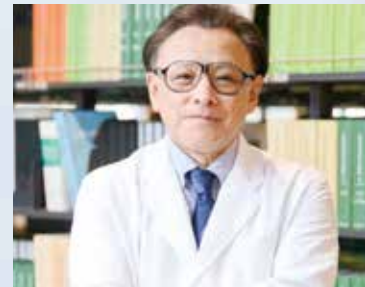
Chief Academic Advisor