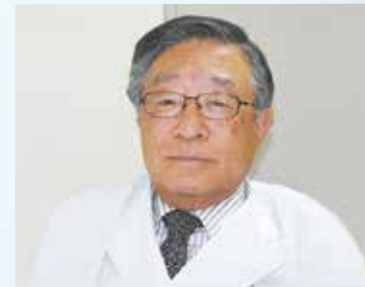
Chief Medical Advisor

Experts from various fields collaborate to provide each patient with the best care through advanced regenerative medicine.